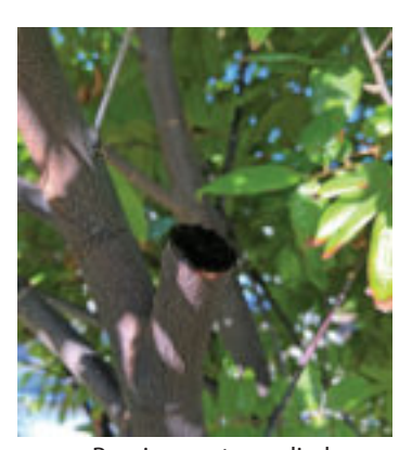
Pruning paste applied