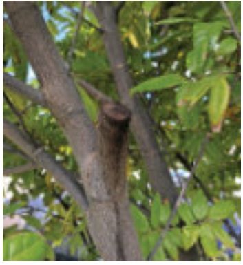
Seven months after paste applied